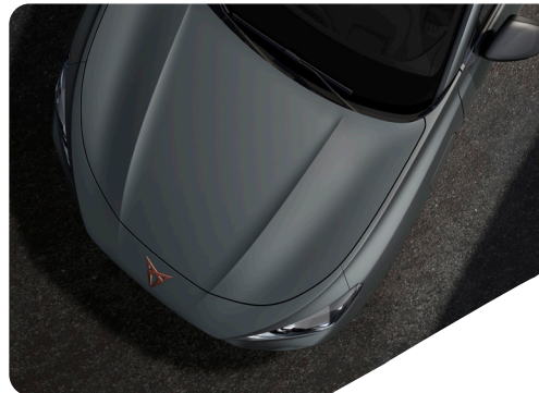
ENCELADUS GREY- Q7Q7 (Matt) VZ