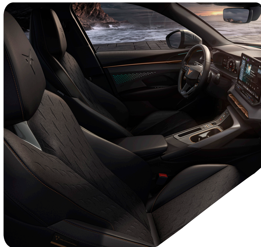
MOON LIGHT DINAMICA SEATS - YA + PS2