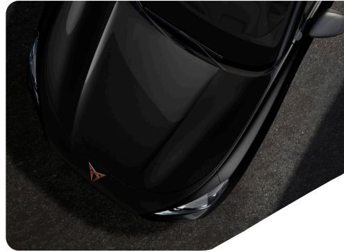
MIDNIGHT BLACK- OE0E (Metallic) T VZ