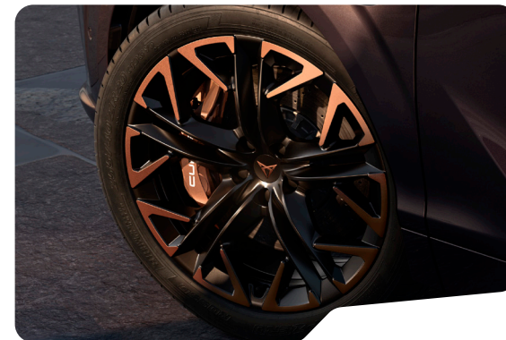
HADRON COPPER 20" MACHINED SPORT BLACK MATT/ COPPER T VZ