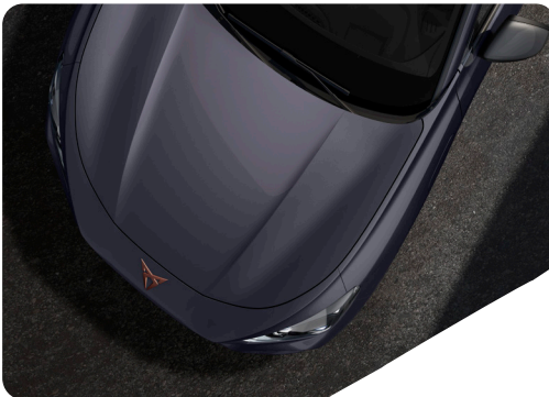
GRAPHENE GREY - R6R6 (Special ) T VZ