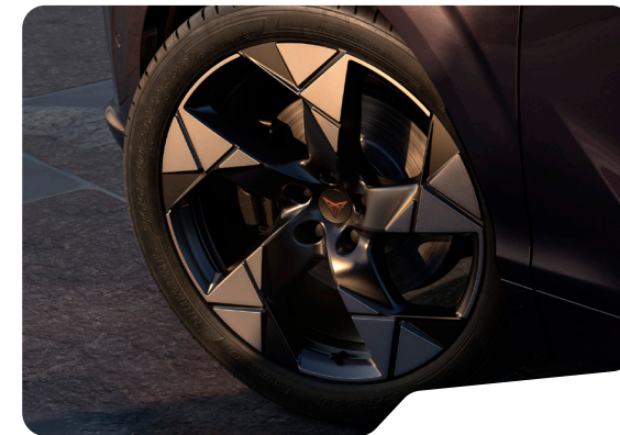
GRAVITY 20" MACHINED SPORT BLACK MATT/ SILVER T VZ