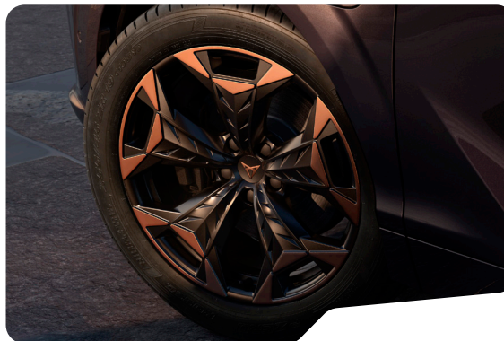
COSMIC COPPER 19" MACHINED SPORT BLACK MATT/COPPER T VZ