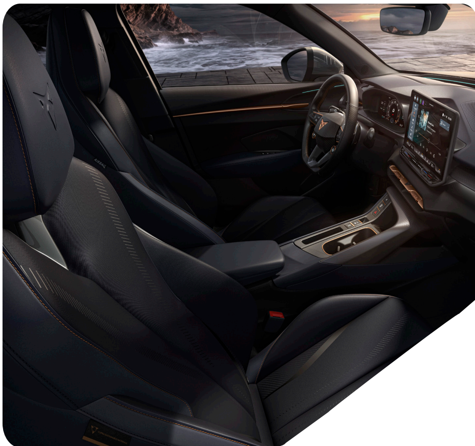
DEEP OCEAN BUCKET SEATS - HM