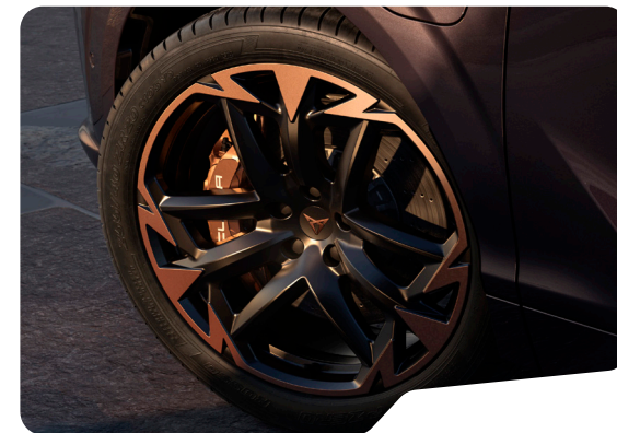
VORTEX 20" MACHINED SPORT BLACK MATT/ COPPER T VZ