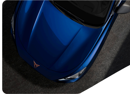
COSMOS BLUE - 2D2D (Metallic) T VZ