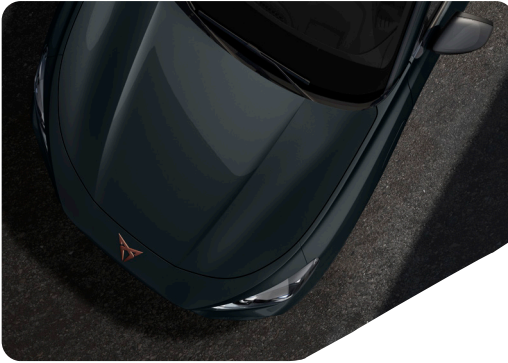
FIORD BLUE - 9K9K (Soft) T VZ