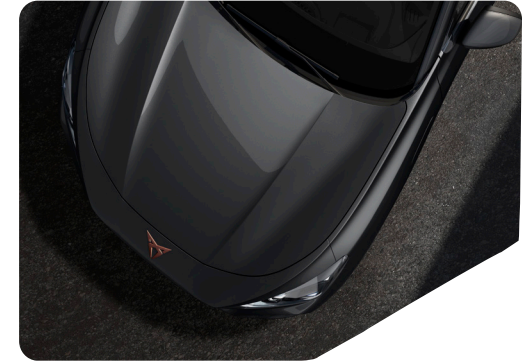
TIMANFAYA GREY - N7N7 (Metallic) T VZ