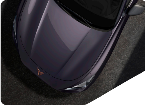
DARK VOID - Q5Q5 (Special Metallic) T VZ